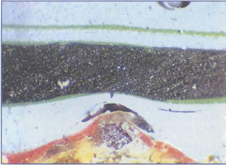
Figure 2 – Photomicrograph of a liquid-applied membrane on concrete. A small peak on the surface caused a discontinuity in the red epoxy layer allowing more moisture vapor to debond the membrane over it.

escape, thus causing accumulation of water vapor pressure between the membrane and concrete surface. This phenomenon can occur within minutes of applying a LAM to concrete surfaces. Since most LAMs are chemically cured and require several hours to cure and establish bond to the substrate, build-up of water vapor pressure shortly after application can inhibit development of a proper bond between the membrane and the concrete substrate. Zones of weakened bond can manifest quickly as blisters filled with water and ultimately cause failure of the membrane (Figures 1 and 2).