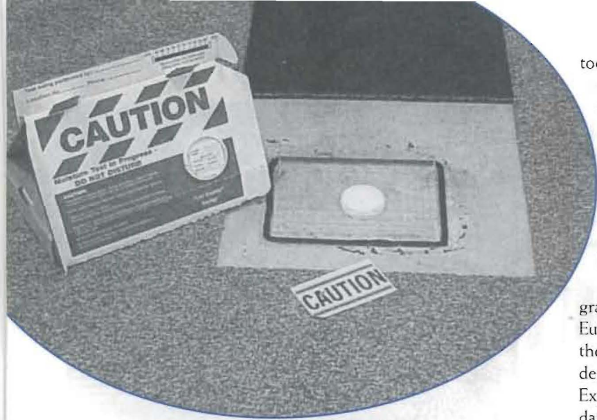
Figure 3 - ASTM F-1869 test being performed on a concrete floor.

Another common myth in the industry is that if the concrete is cured for 28 days, it will be suitable for application of liquid-applied membranes. Several membrane manufacturer application instructions indicate "fully-cured" or "28-day cured concrete" as the only moisture criteria for application of their membrane. The most important factor to consider is service environment. If the concrete has cured for 27 days and then is exposed to rain, the moisture content in the concrete will be increased to a level close to the initial moisture content and will require a longer drying time than concrete that is kept continuously dry. Other factors such as ambient temperature and humidity during curing will affect the rate of drying. The age of concrete does not correlate well with its moisture vapor emission rate (MVER).