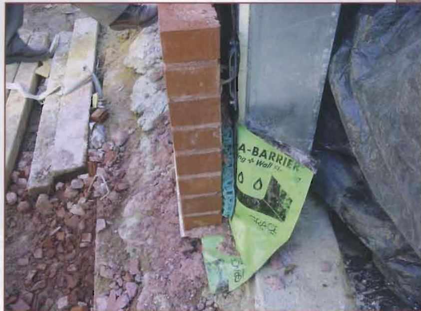
Photo 3: Narrow wall cavity difficult to keep clean during construction.

Even if these materials are separated, as in cavity walls, the differential movement still needs to be accommodated. The exterior wythe of brick is required to be tied to the interior CMU wythe at regular vertical and horizontal spacing, as specified in Section 6.2.2.5 of the ACI 530 Building Code Requirements for Masonry Structures. This is usually accomplished with individual ties or continuous horizontal reinforcement. In either case, flexibility is necessary to allow horizontal