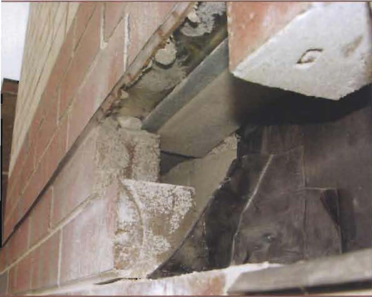
Photo 5: Mortar improperly placed in horizontal mortar joint and brick not properly supported on shelf angle.

consider the expected service life of the wall system. Most masonry wall systems are expected to last far more than 50 years. Yet the use of corrosive metals within the walls will significantly lower their life expectancy. Corrosion of metals in masonry walls can lead to many problems, including cracking and bowing. Correction of such deficiencies requires costly and extensive rehabilitation. As such, durable metals should be used in conjunction with masonry wall construction. At a minimum, ties and bolts should be made of galvanized steel. In many cases, the use of stainless steel ties and bolts can be justified when considering the life cycle costs of the system. In the authors' opinion, shelf angles and lintels used in modern masonry construction should be hot-dipped galvanized after fabrication. If galvanizing cannot be justified, shelf angles and lintels should be coated with high performance, corrosion-inhibiting coating systems to achieve a service life that is compatible with the expected service life of the wall system. In most cases, life cycle costs for these