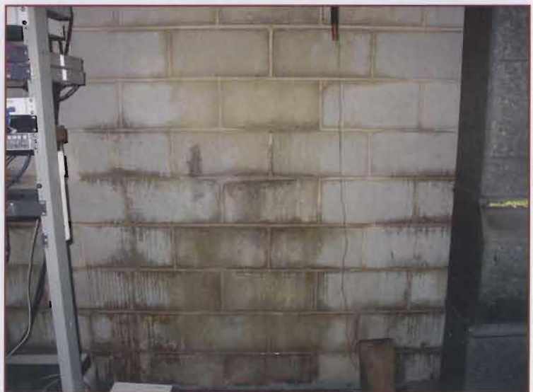
Photo 1: Water penetrating to interior surface of CMU wythe of solid masonry wall.

Cavity wall design recognizes that water penetration into masonry walls is inevitable and provides the necessary means to manage the water. Properly designed, detailed, and constructed cavity walls can prevent water penetration through the system.