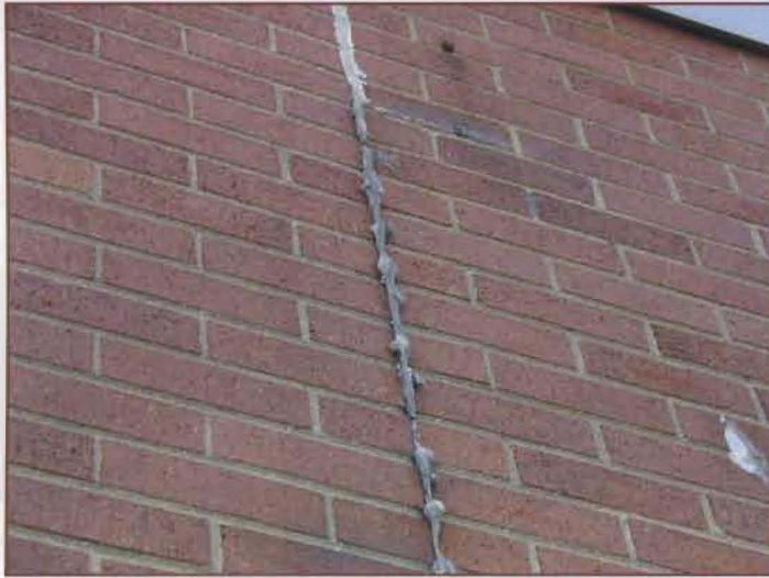
Photo 2: Sealant compressed out of improperly sized vertical expansion joint.

Horizontal expansion joints must accommodate vertical expansion of masonry walls. These joints are usually placed immediately beneath shelf angles, which are typically supported by the building frame at each floor line. If clay masonry is installed tightly to the bottom of the shelf angles, the wall will likely buckle since vertical expansion will be restrained. Placing shelf angles at every other or every third floor will increase the accumulated movements in the exterior wythe and exacerbate the effects of improperly constructed hori-